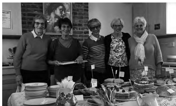
Ready for the first customers