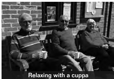
Relaxing with a cuppa