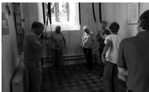
The Method winning Scratch team from Kersey