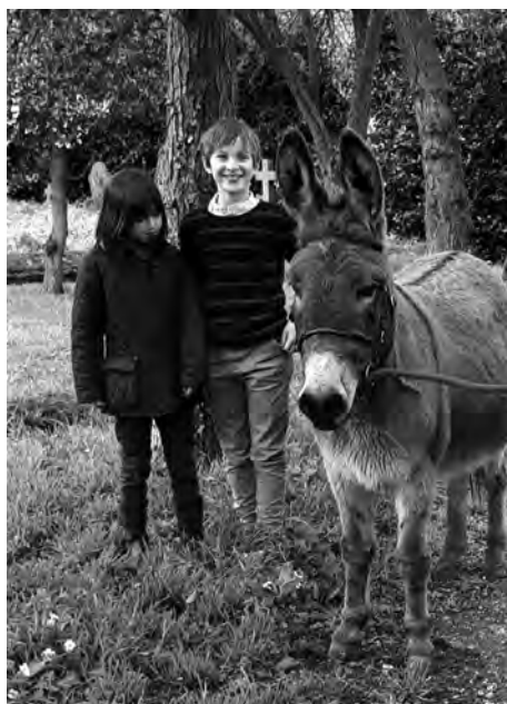
Dilly the donkey greeting two young churchgoers at the Palm Sunday Service.