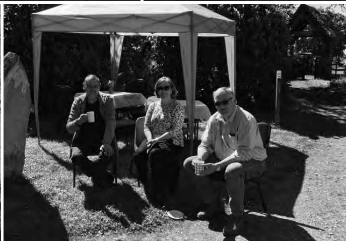
Enjoying the sunshine