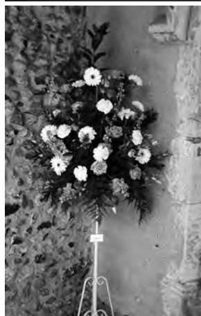
Just one of the lovely floral displays