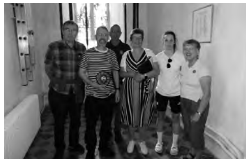
The Striking Competition winners - Haverhill