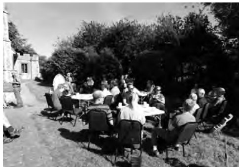
The Striking Competition teams enjoying sunshine and teas