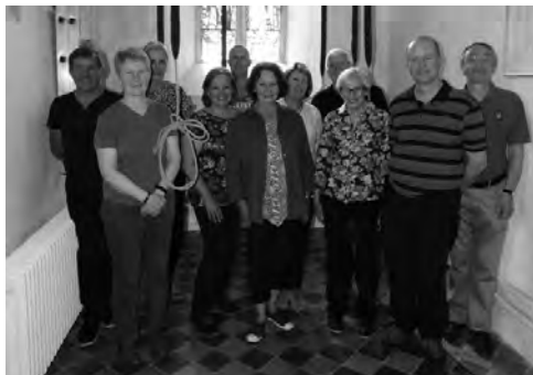
Learners & teachers from Lt Cornard- a few missing on holidays