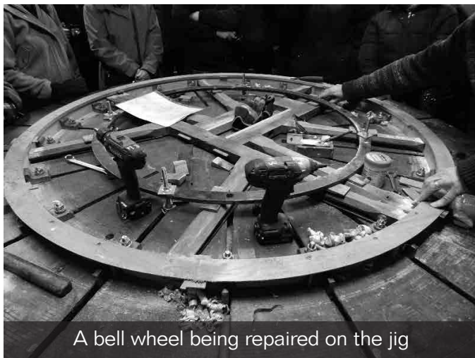
A bell wheel being repaired on the jig

A beautiful day saw a Kings coach take some folk from Lt Cornard Church to the John Taylor & Co Bell casting foundry in Loughborough. We were met by a journalist from BBC Look East who filmed much of the tour. A copy of part of that film is available on the BBC news website.