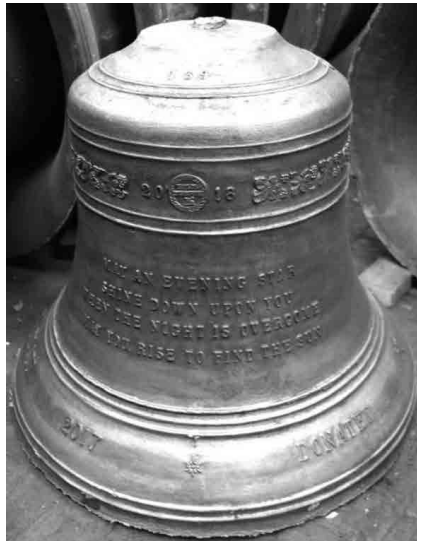
Our bell one week on, still needs some finishing off!