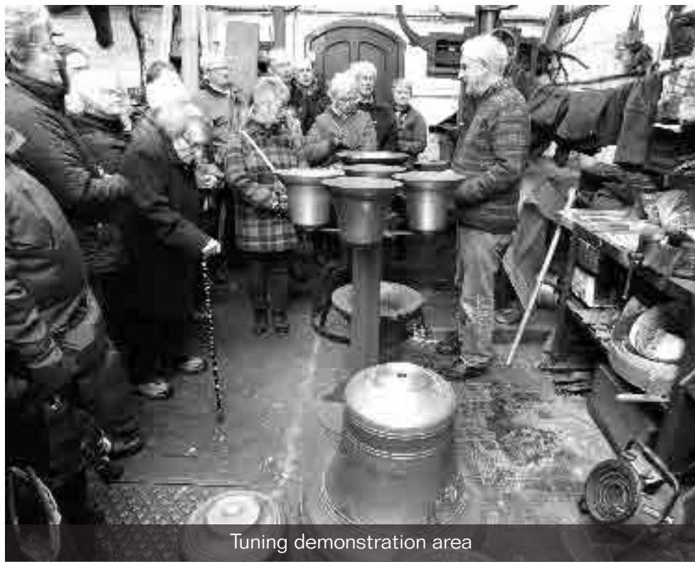
Tuning demonstration area