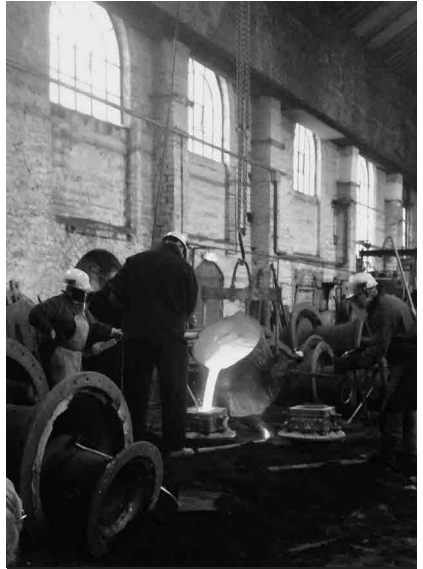
Our bell being cast