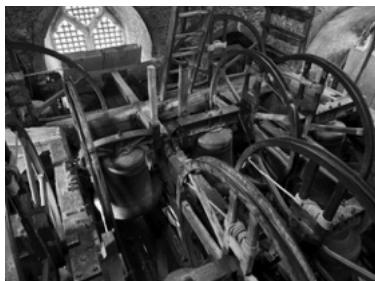
Inside the Bell Tower at Bures Church

We will be ringing with other local churches at the forthcoming Suffolk Guild Open Tower days. The first of these for 2024 has already taken place and was at Lavenham, where the bells are heavy in comparison to ours with the tenor bell weighing in at twenty-one hundredweight. We ring at Bures church too and have just helped with some repairs to their tenor bell.